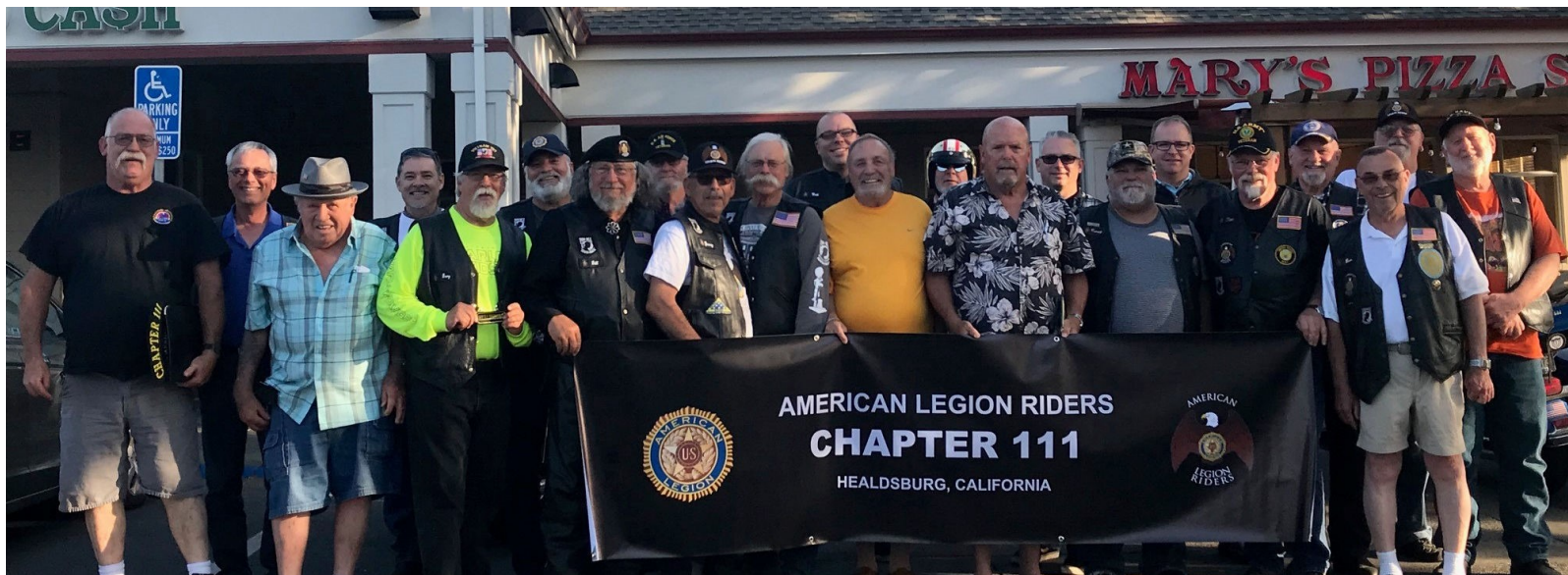
Chapter meeting at Mary's Pizza Shack in Windsor