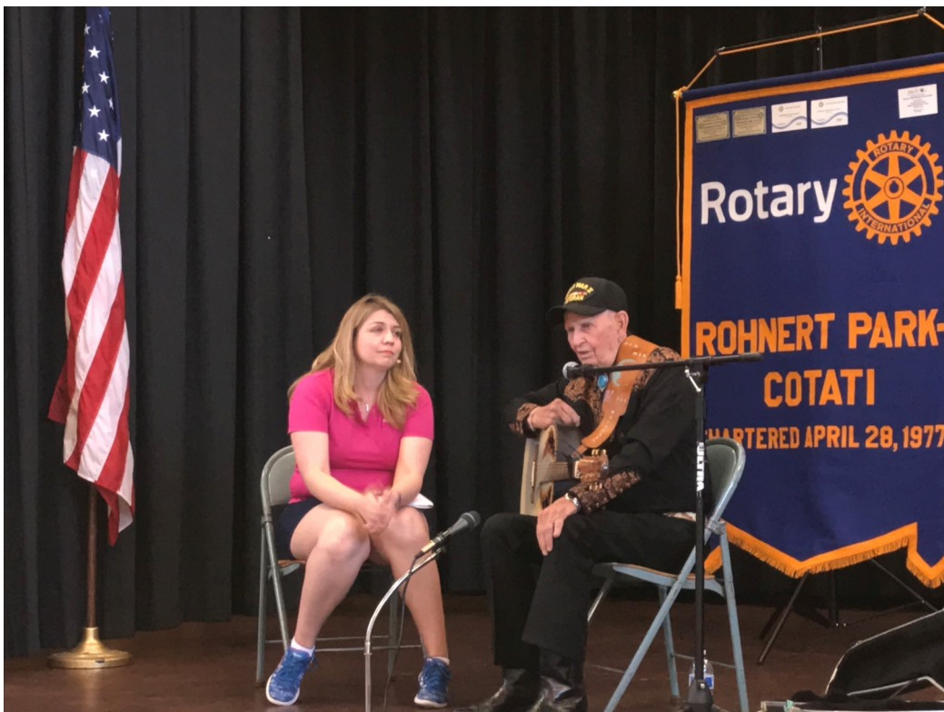
World War II Veteran entertains the crowd at the Rotary Veteran Appreciation Day BBQ. The Army Veteran fought in Germany during the war and also participated in the Battle of the Bulge. The ALR was represented at the event.