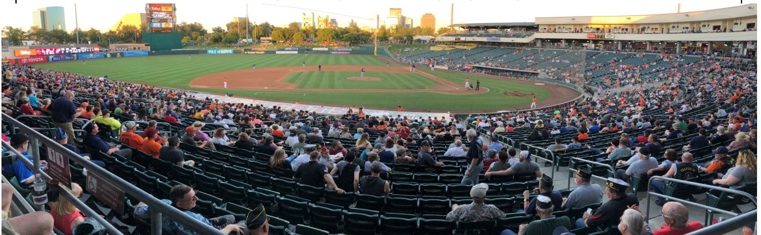
American Legion night at the River Cats baseball game on June 22nd