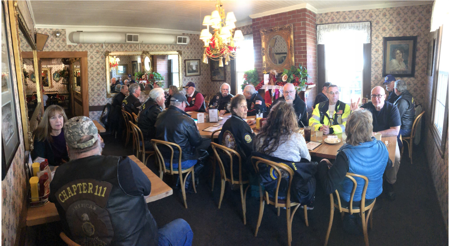
American Legion Riders end of year brunch at the Washoe House, December 16, 2017